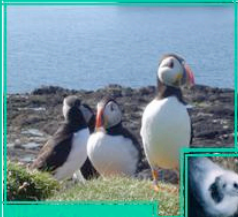
Breeding sea Birds, Lunga